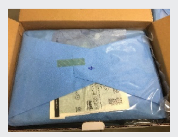
View of sterile barriers inside the box

Initial integrity testing showed a high failure rate of approximately 50%, presenting as pinholes in the corners of the header bag. Time was of the essence to gain necessary approvals and meet project parameters.