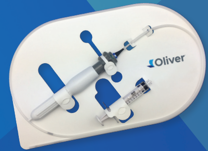
Early diagnostic cancer detection kit for robotic delivery

A Flexible, Cost-Effective Option for Pouches or Trays