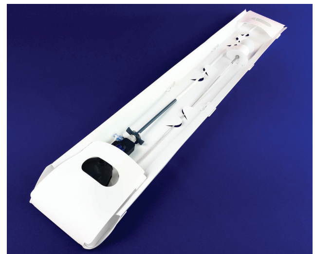
Device used in pediatric heart surgery

Unmatched design expertise, robust card configurations and the ability to get immediate feedback = higher confidence in passing testing the first time.